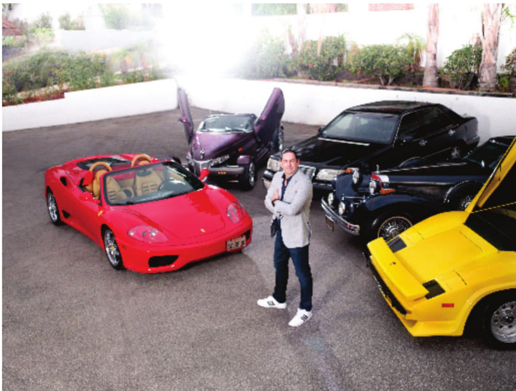
From a young age O'Brien considered cars to be 4D functional art that you can see, feel, hear and sometimes smell.