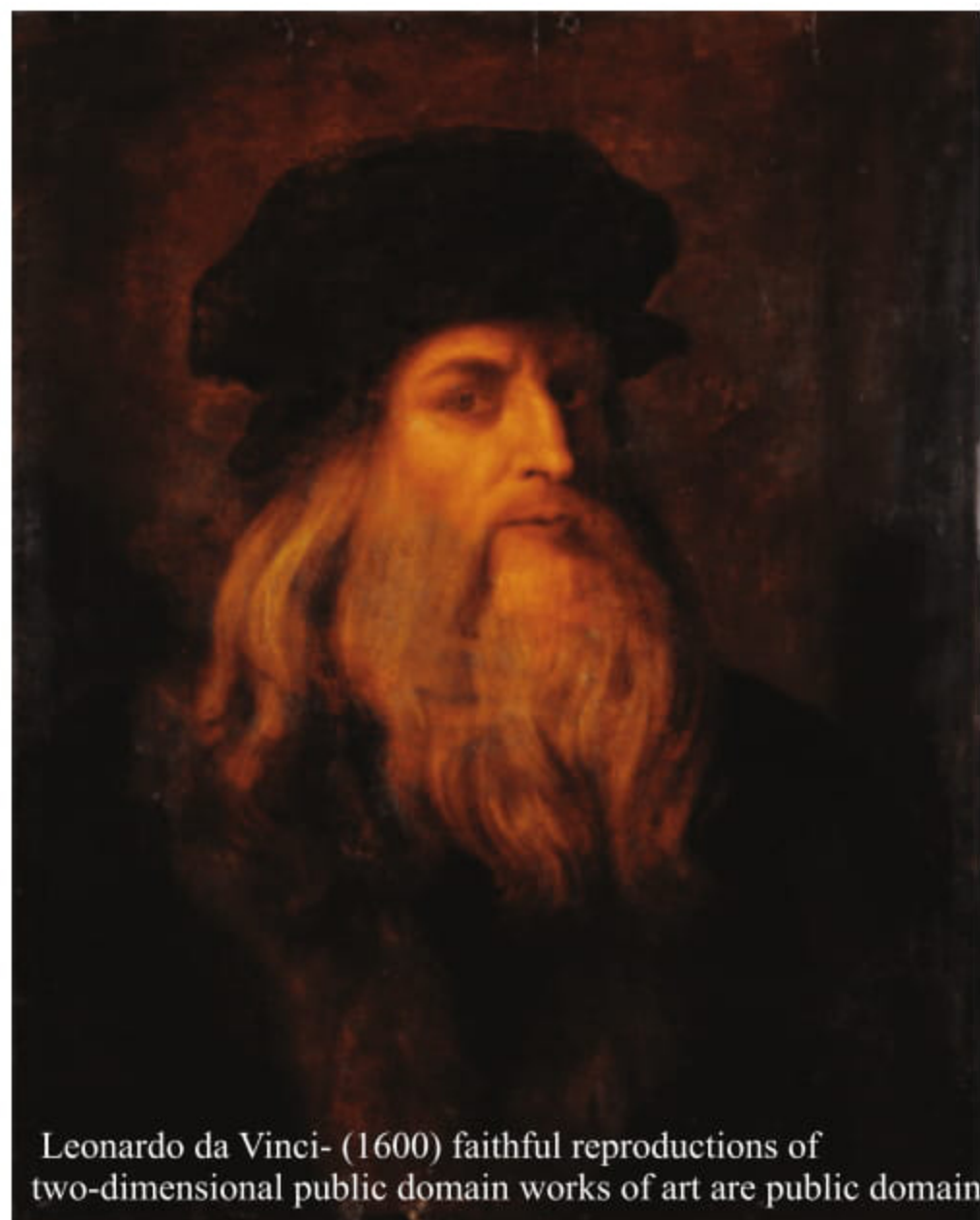
Leonardo da Vinci- (1600) faithful reproductions of two-dimensional public domain works of art are public domain

Leonardo da Vinci (1452-1519) is irrefutably regarded as the quintessential Renaissance man. Living in a time in history when cultural change experienced an explosion of exponential growth in the areas of science, art, and philosophy, da Vinci rose to become what is known as a polymath or "Universal Man". Beyond his insatiable desire and ability to learn, design and create; what set da Vinci apart from many of his contemporaries